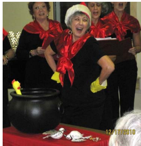
Broward Women's Chorus