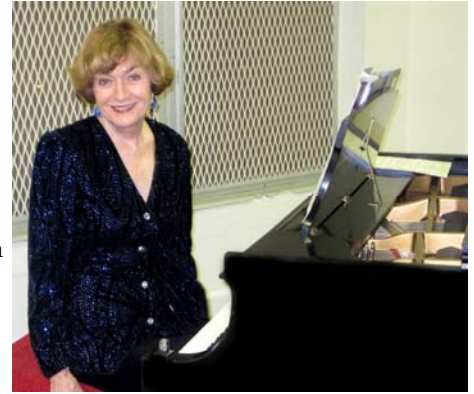
Pianist from Broward Women's Choral Group